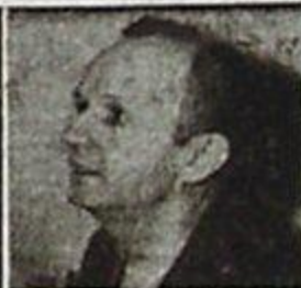
Dönitz: zehn Jahre