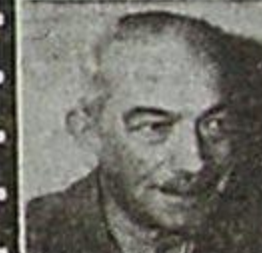
Neurath: Fünfzehn Jahre