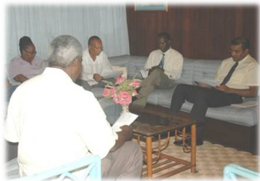
Minister of Health