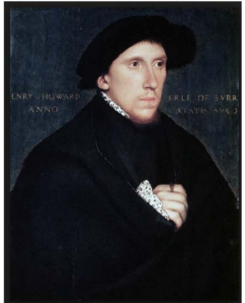
Henry Howard (d. 1547), earl of Surrey, by Holbein

groce lxxiii. s. Gloues of Canaria vnwrought the groce lvi. s. Gloues called Venice Gloues vn- wrought the dosen viii. s. Gloues of Venice/ Millan/ and Ca- naria wrought with silk oz siluer the dosen lxx. s. Gloues knit of silk the doz. xx. s. Golde foile the groce iii. s. iiii. d. Golde papers the groce vi. s. viii. d. Golde of Bridges the mast contay- ning ii. li. di lvi. s. Golde skinnes the kip containing. l. skinnes xx. s. Gote skinnes the dosen xx. s. Grain of portingale called rotta the pound iii. s. iiii. d. Grain powder the li vi. s. viii. d. Grain of Ciuile in bures the pound iii. s. Graines the c. pound containing v. xx. iii. l. vi. s. viii. d. Graines the pound viii. d. Grana