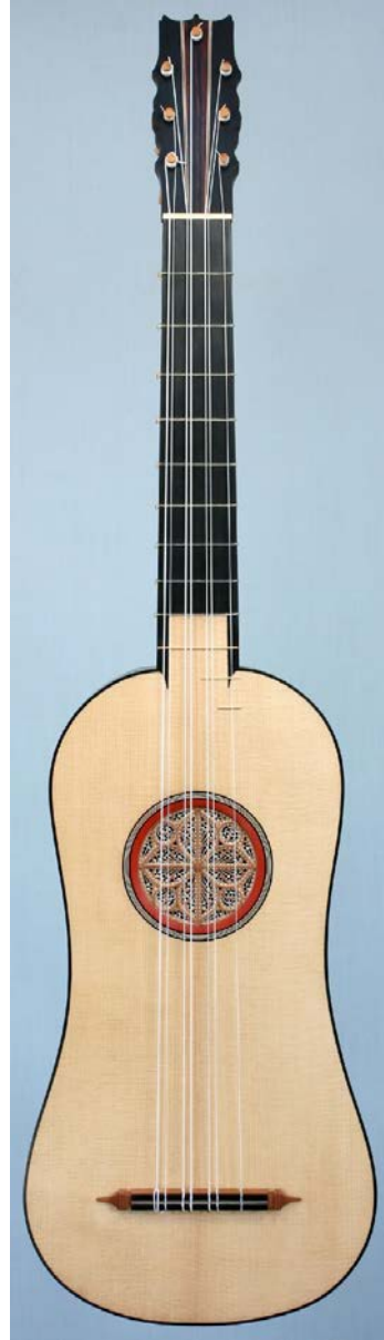
Renaissance guitar by Alexander Batov.