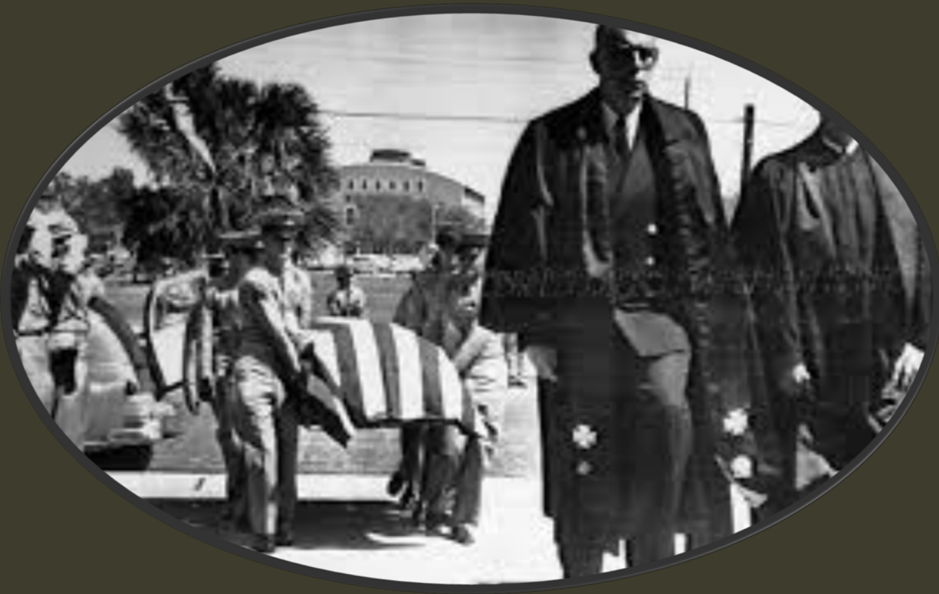
Ribbon Creek hazing tragedy of 1956