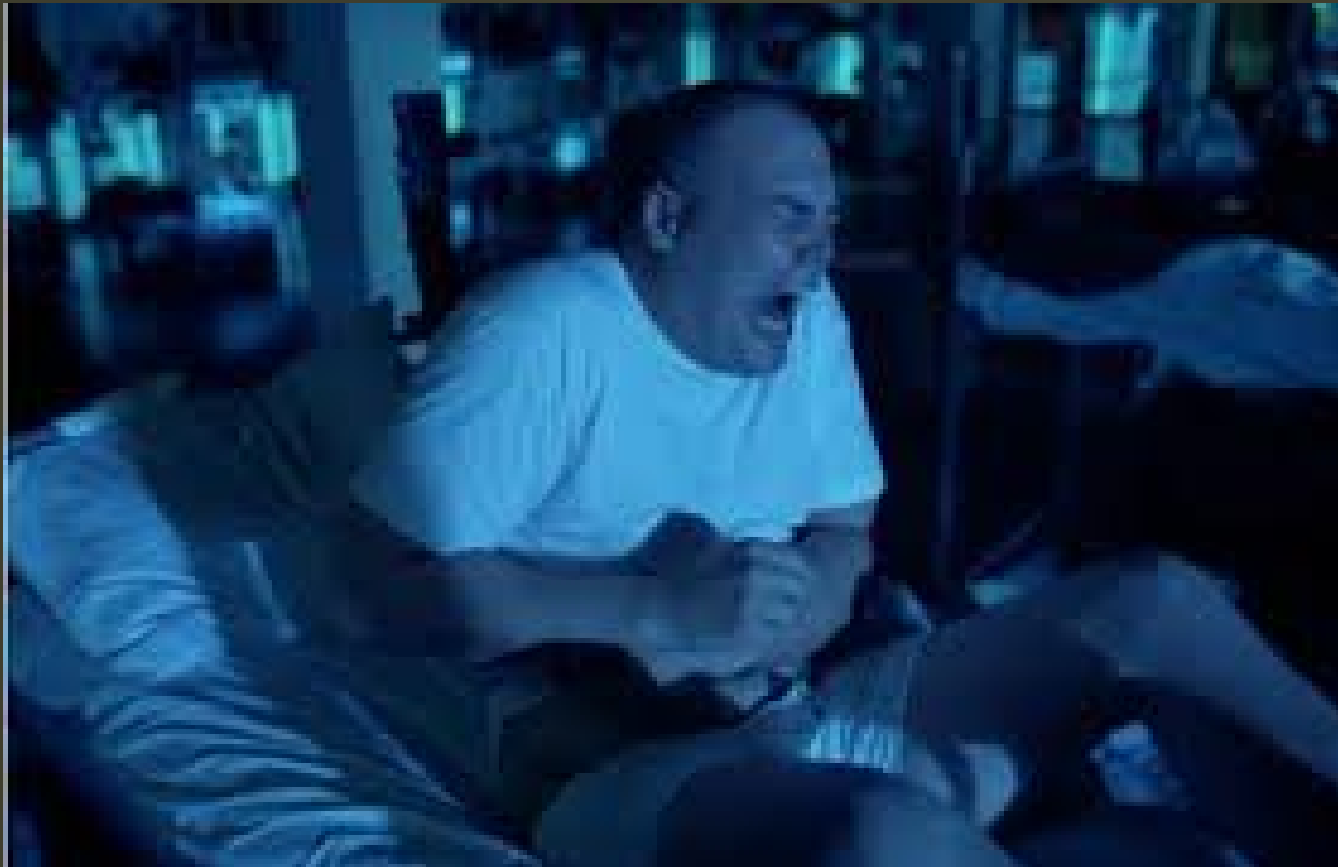
Stanley Kubrick's "Full Metal Jacket" (1987)