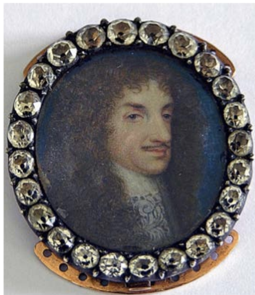
Miniature of King Charles II. Private Collection.

Extract from a letter of 29 May 1665, from Charles II to his sister, Henriette-Anne Paris, Archives du ministère des affaires étrangères, Mémoires et documents, Angleterre, vol. 26, f. 96v