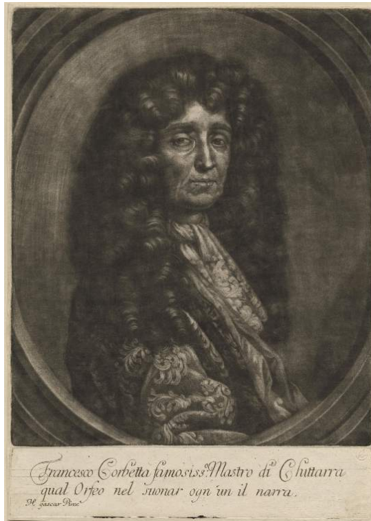
Francisco Corbetta, after H. Gascar (private collection)