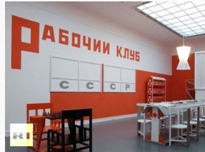
Constructivist design of a workers' club