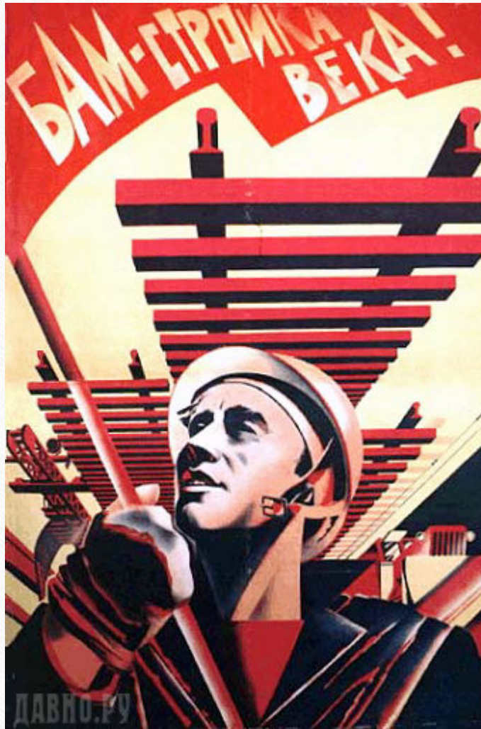
‘BAM: the construction (project) of the century!’ (1977)