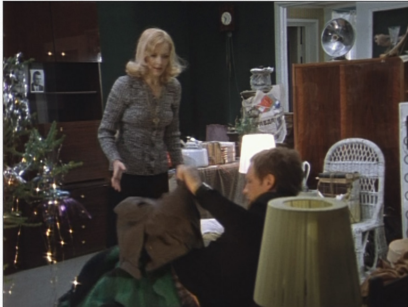
The Irony of Fate (1975)