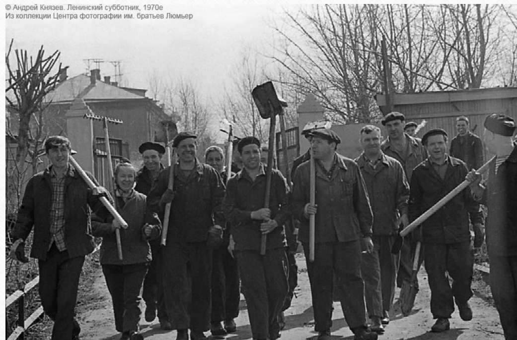
Ленинский субботник, 1970е

Second, transformable furniture served to mask functions that were considered inappropriate and secondary to the primary uses of certain rooms and furniture. For example, this ensured that a 'common room' appeared as one with its appropriate functional zones. The primary appearance and use of transformable furniture always corresponded to the correct representation of a common room as a place where members of the family