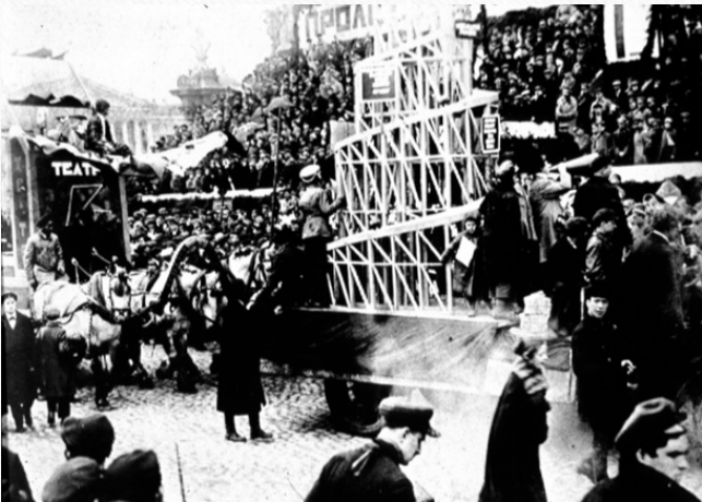
Tatlin's monument to the Third International