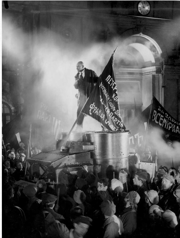
C. Eisenstein, October (1927)