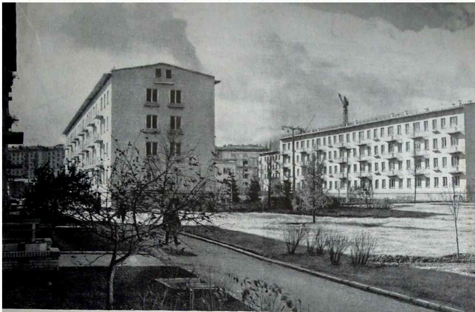
9-й квартал Новых Черемушек. Общий вид жилой застройки