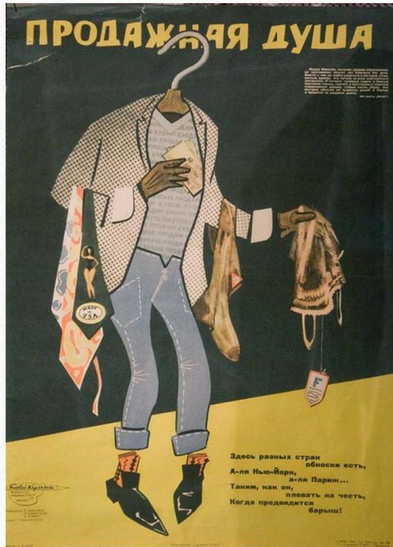
A Soul for Sale: anti-speculation poster