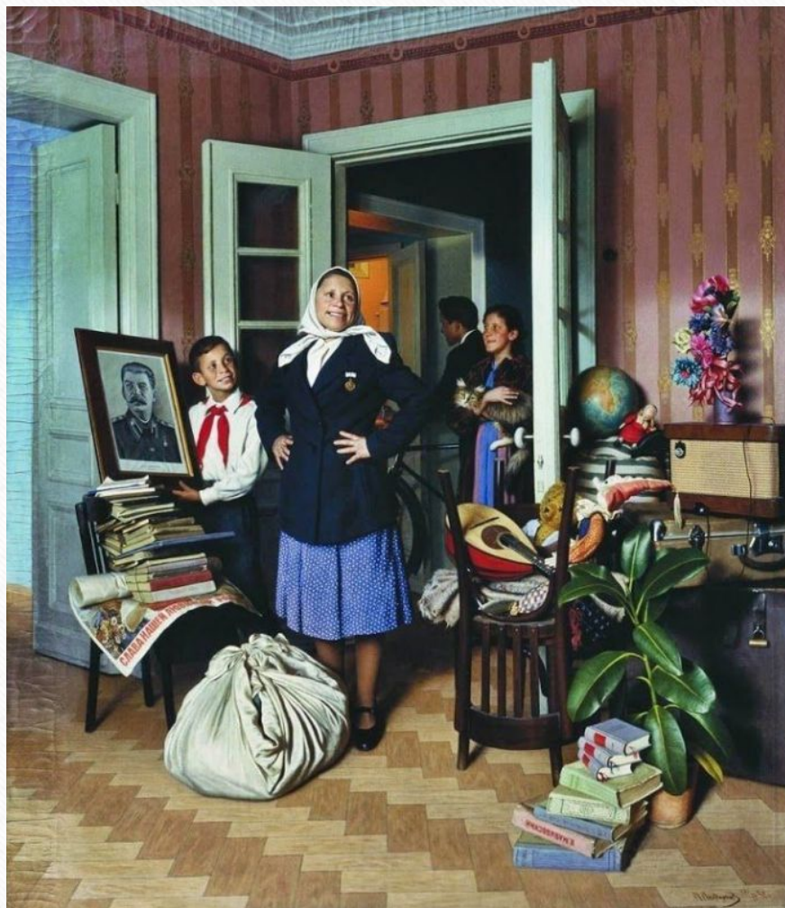
Aleksandr Laktionov, 'Moving into the new apartment' (1952)