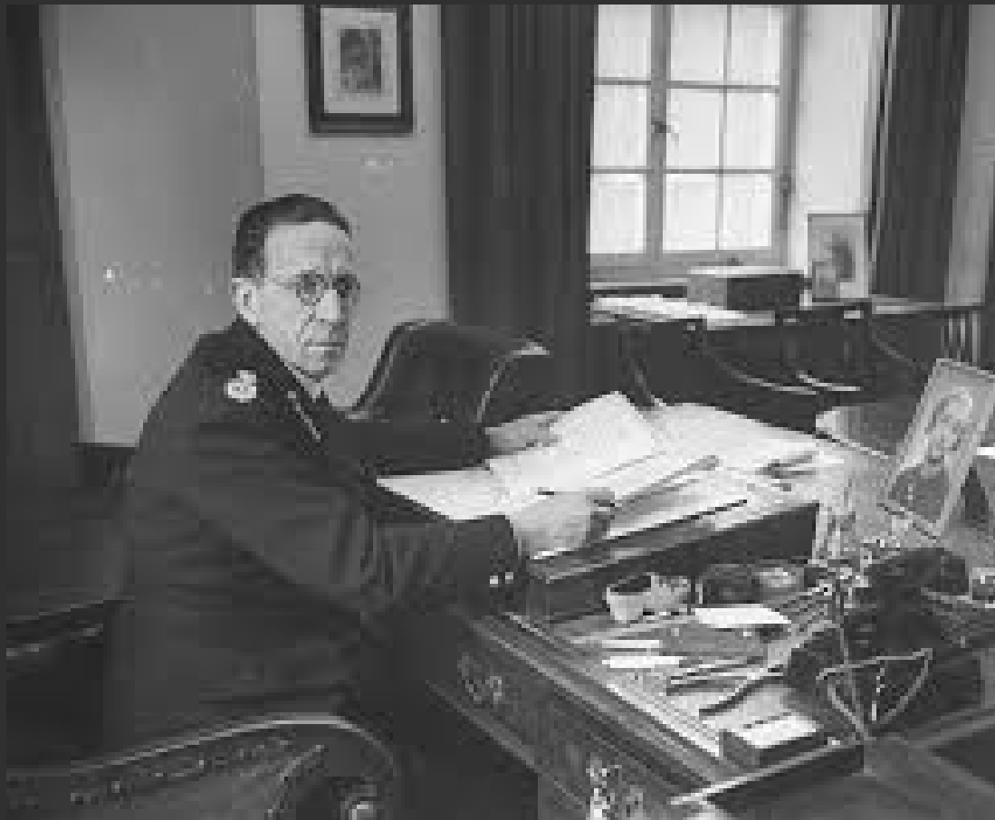
Sir Harold Scott Commissioner of Metropolitan Police (1945-53)