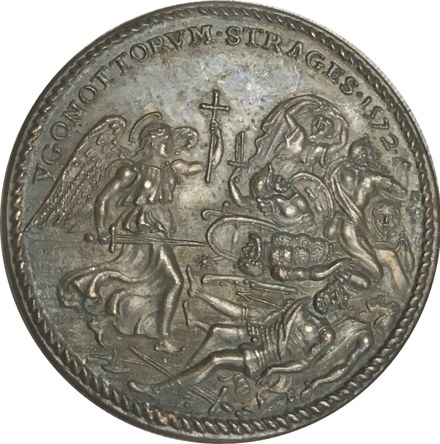
Medal celebrating the St Bartholomew's Day Massacre struck by Pope Gregory XIII