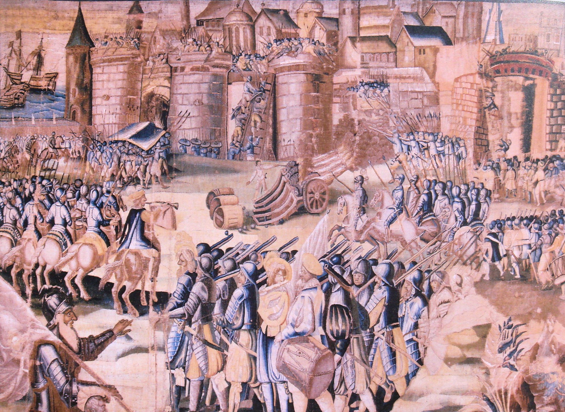
Siege of La Rochelle 1572-3, contemporary tapestry