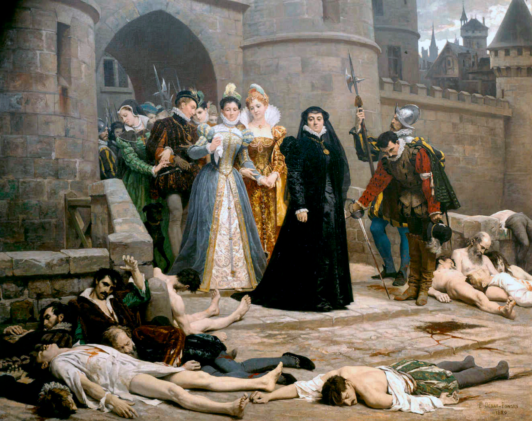
Édouard Debat- Ponsan, ‘One morning at the gates of the Louvre’, 1880