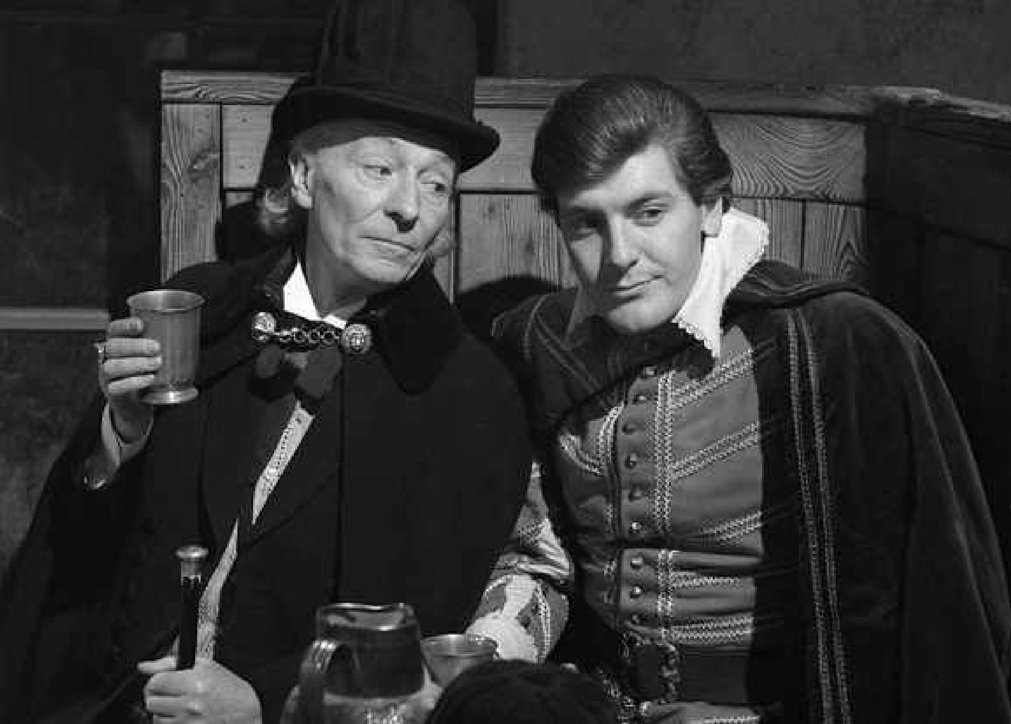
Doctor Who, 'The Massacre of St Bartholomew's Eve' (1966)