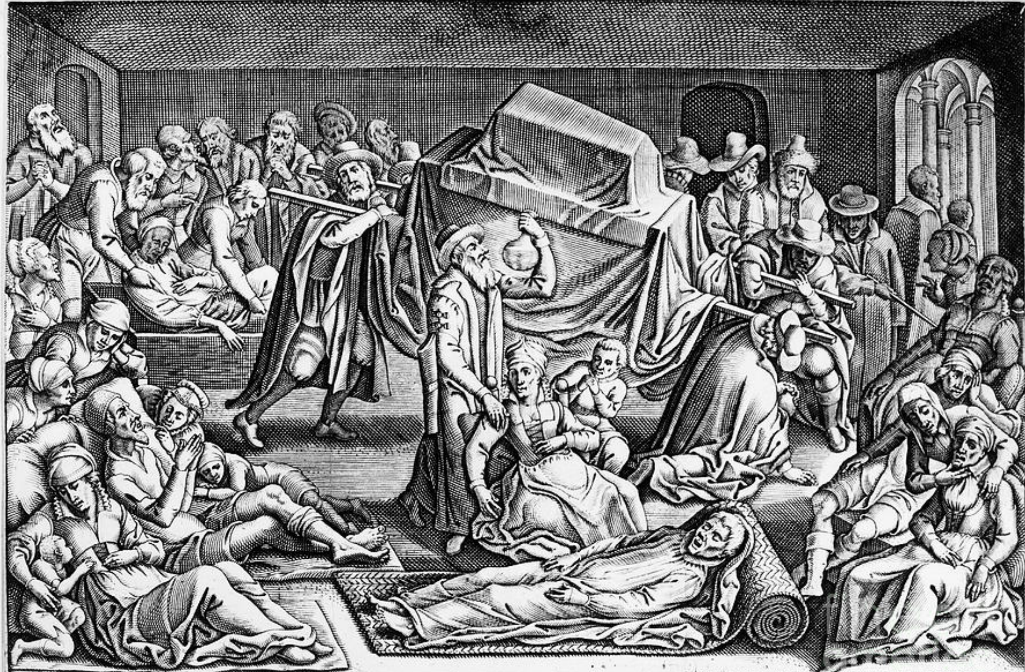
La peste pendant la Siège de Leide.