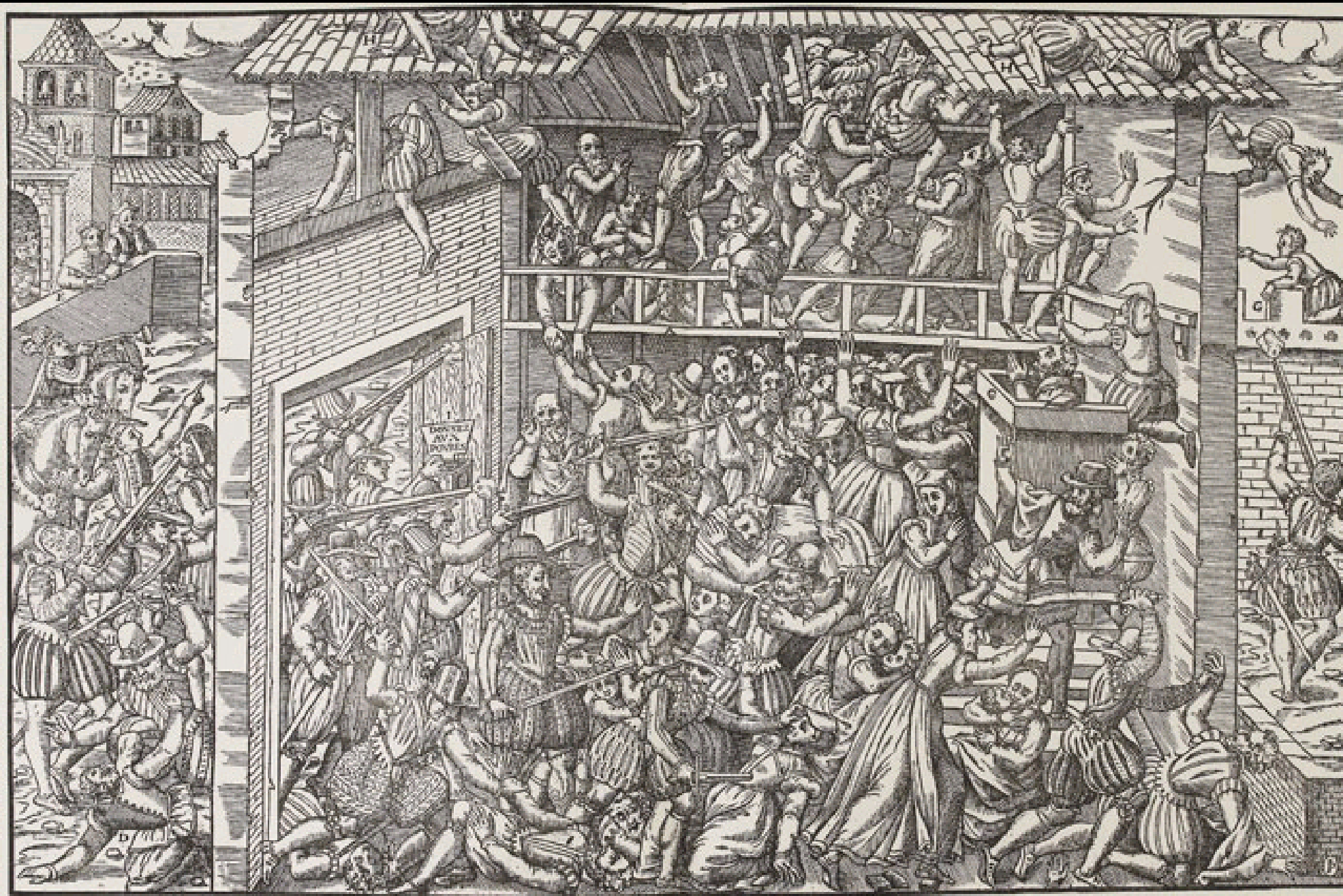
The massacre at Vassy, 1 March 1562