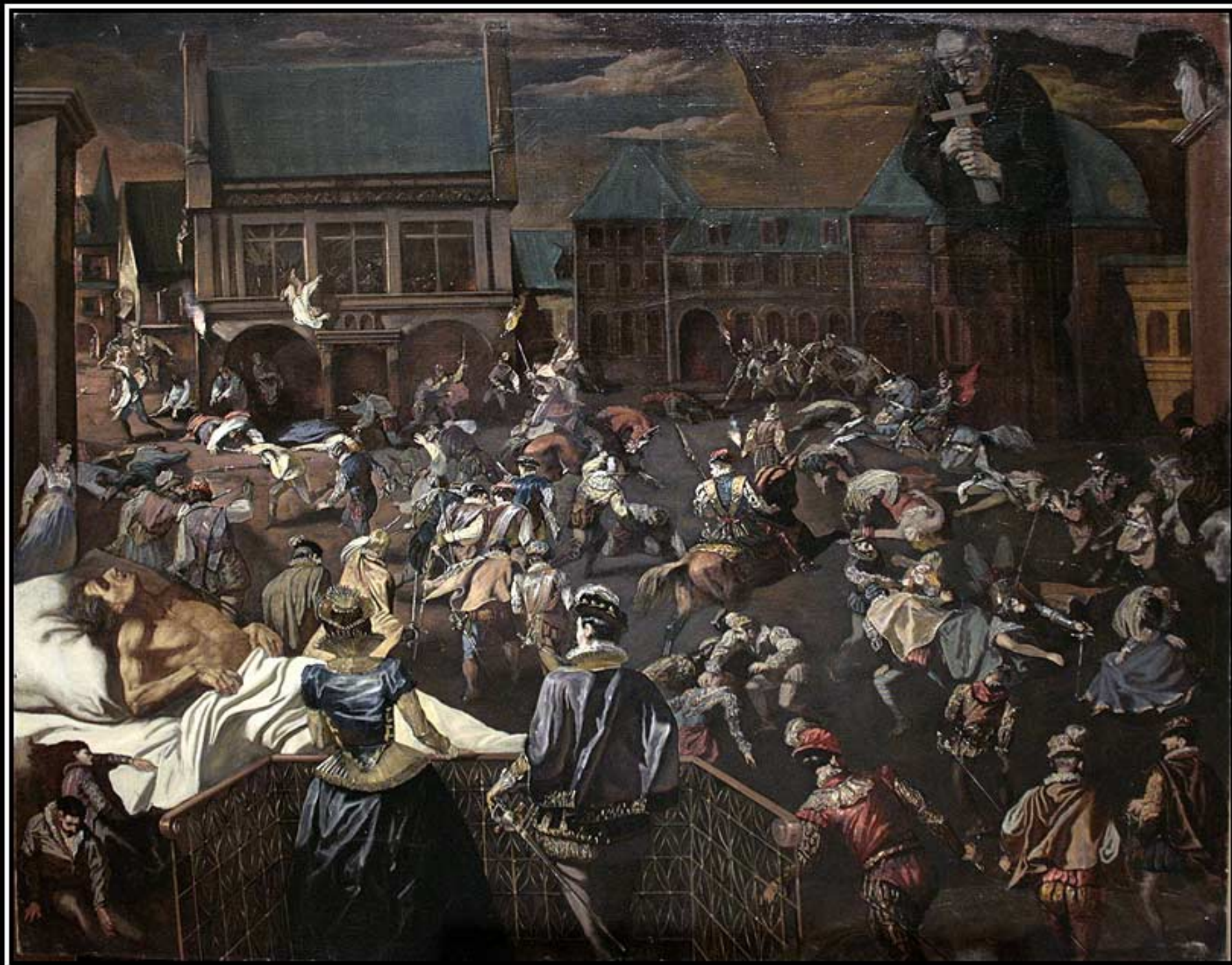
Ilyas Phaizulline, 'Vision of the St Bartholomew's Day Massacre', 1998