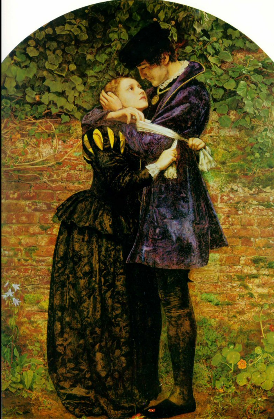
John Everett Millais, 'A Huguenot on St Bartholomew's Day', 1852