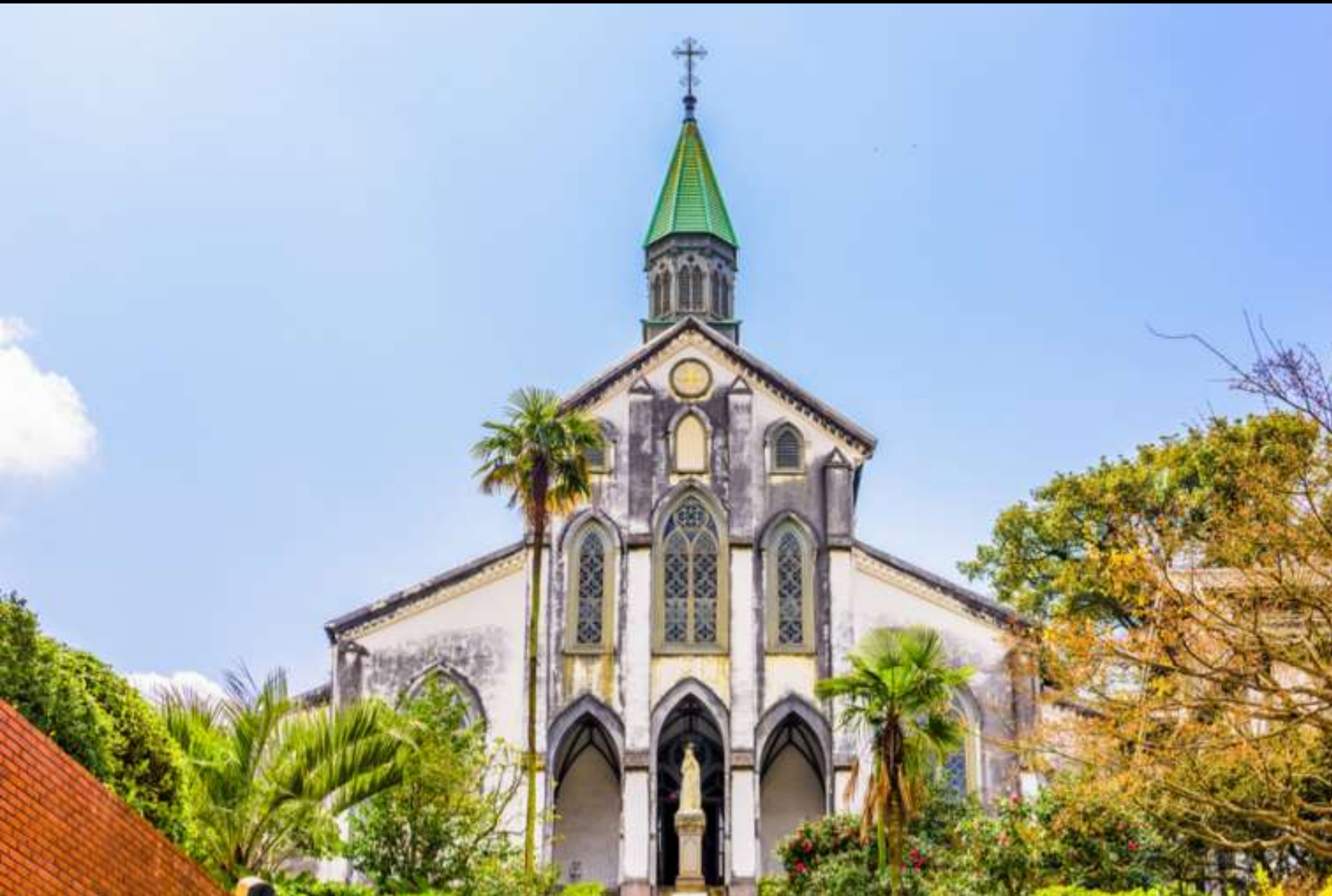
The Basilica of the Twenty-Six Martyrs, Nagasaki