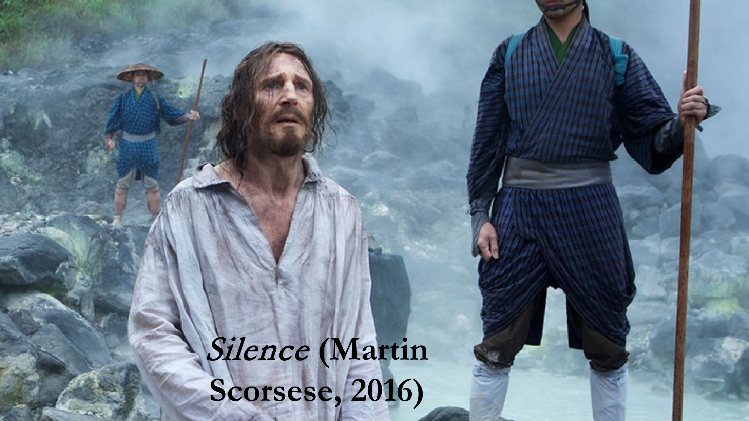
Silence (Martin Scorsese, 2016)