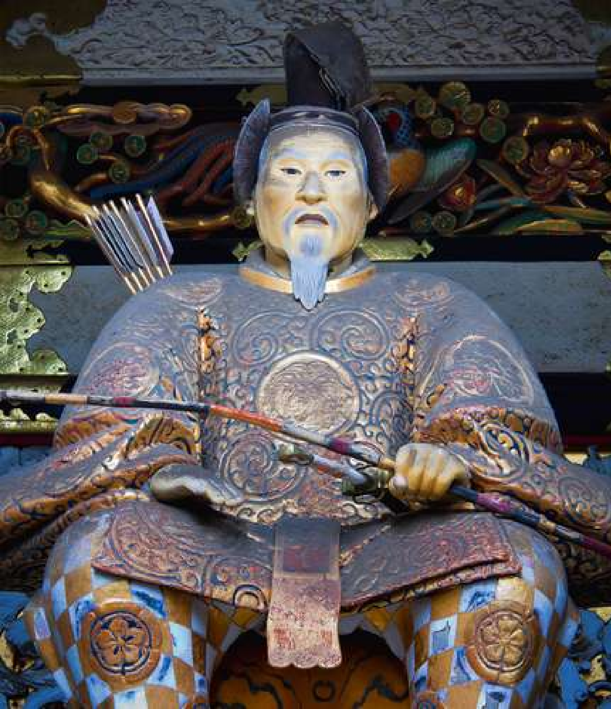
Tokugawa Ieyasu (1543-1616), founder of the Tokugawa Shogunate