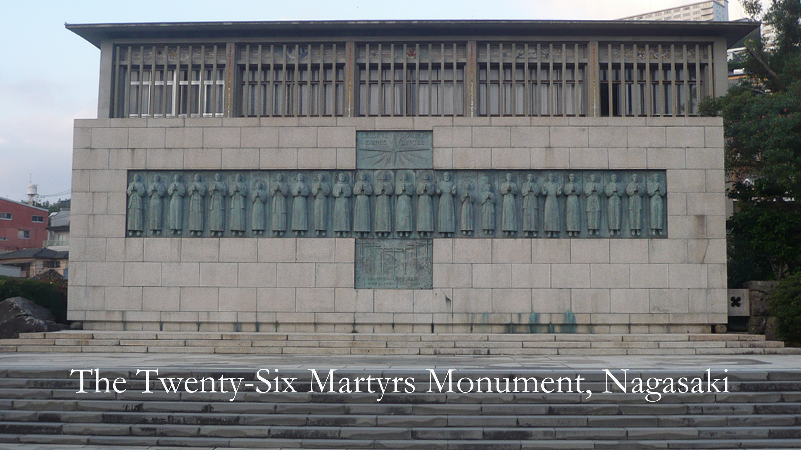
The Twenty-Six Martyrs Monument, Nagasaki