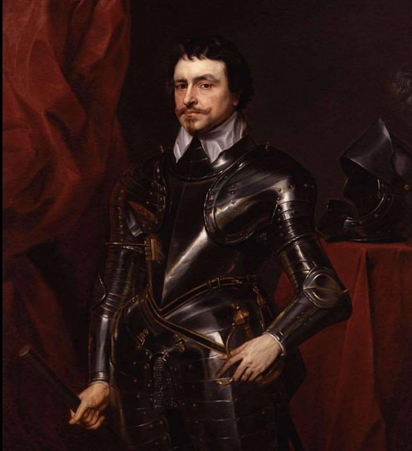
Thomas Wentworth, lord deputy of Ireland 1632-9