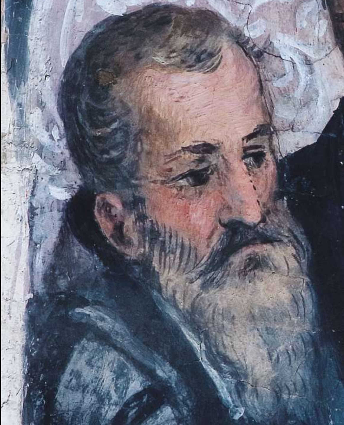
Hugh O'Neill, earl of Tyrone and aspirant High King of Ireland (1550-1616)