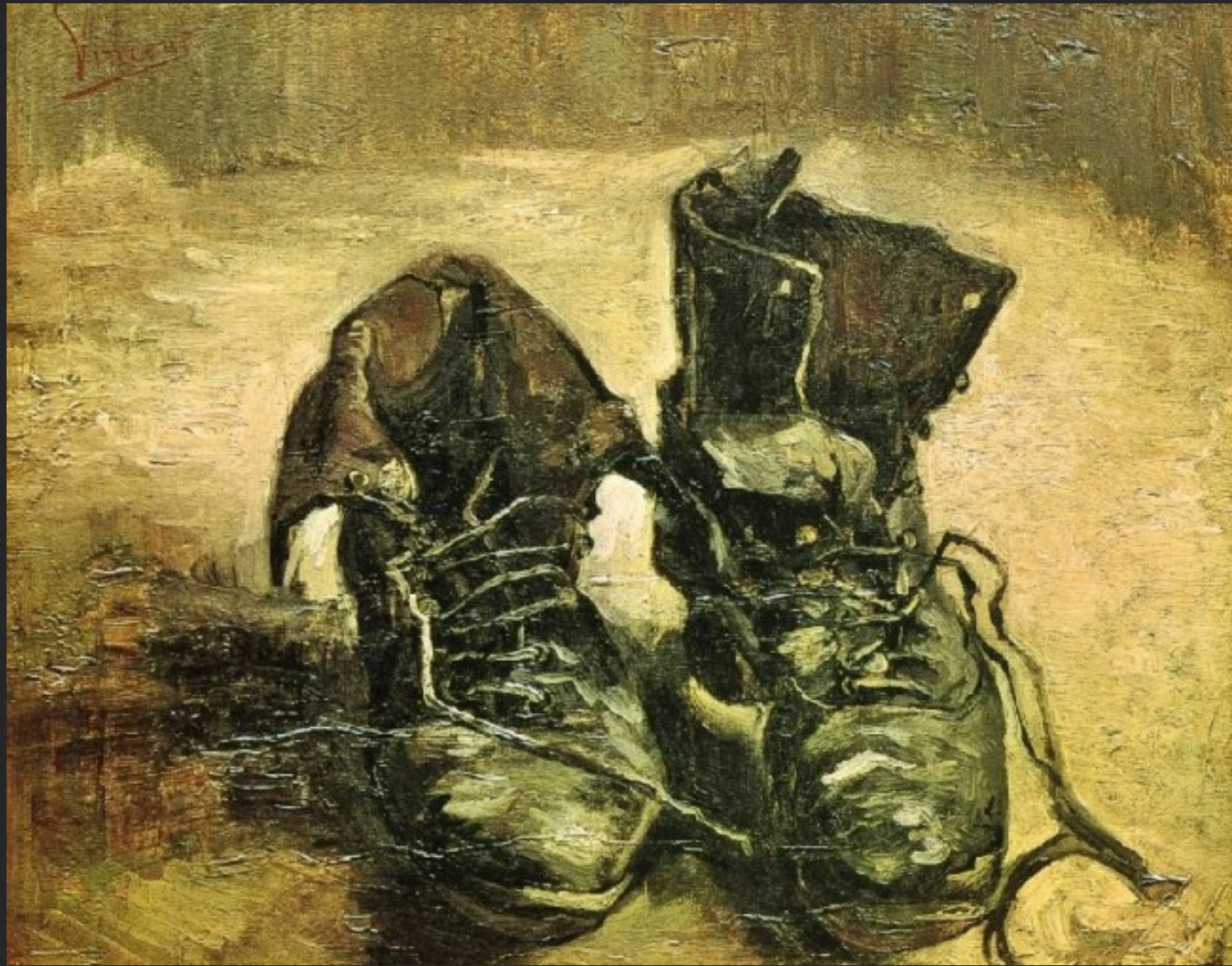
Heidegger and Van Gogh's 'A Pair of Shoes'