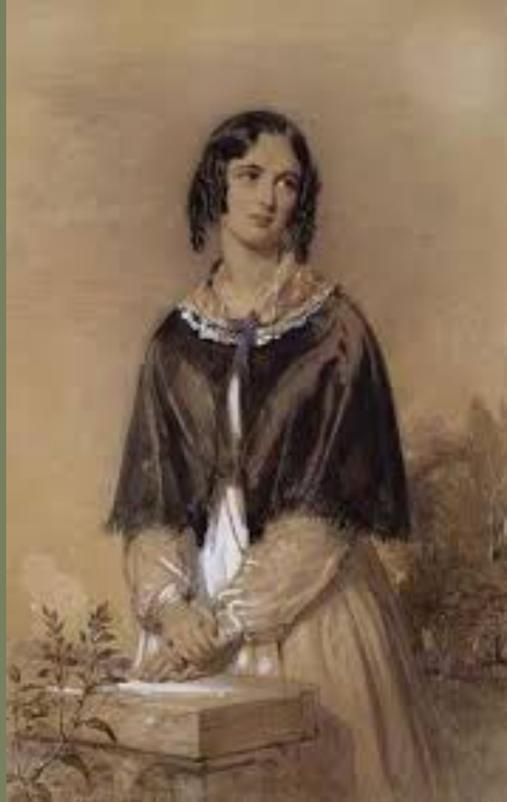
Charlotte M. Yonge