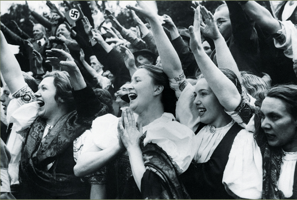
CHEERING ADOLF HITLER