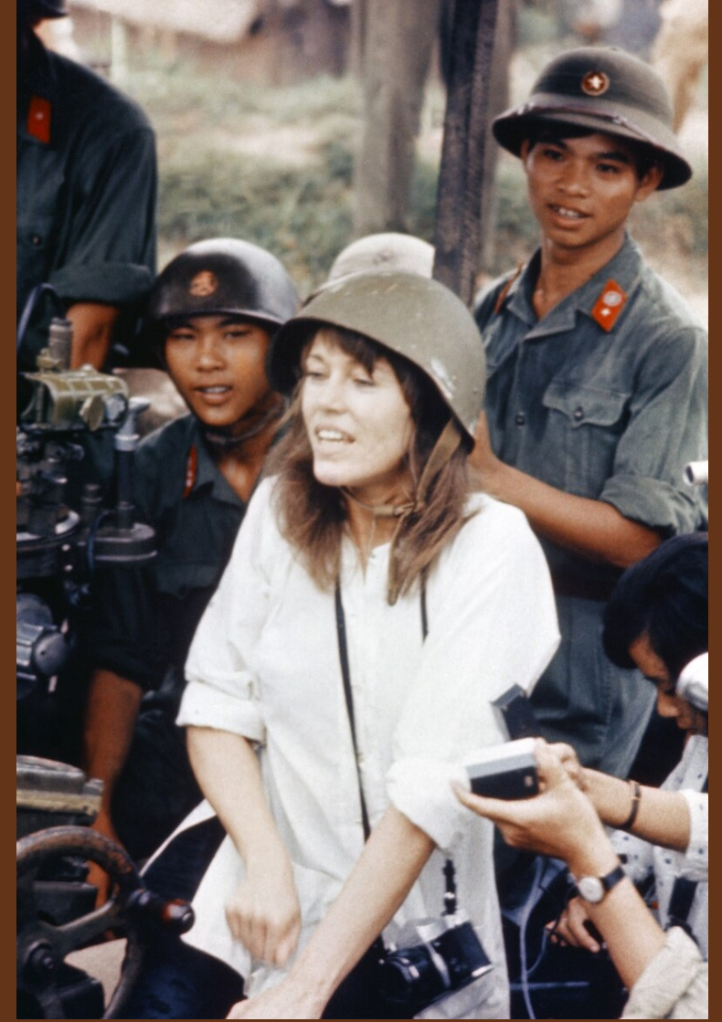
Christine Keeler (1963) and Jane Fonda (1972)