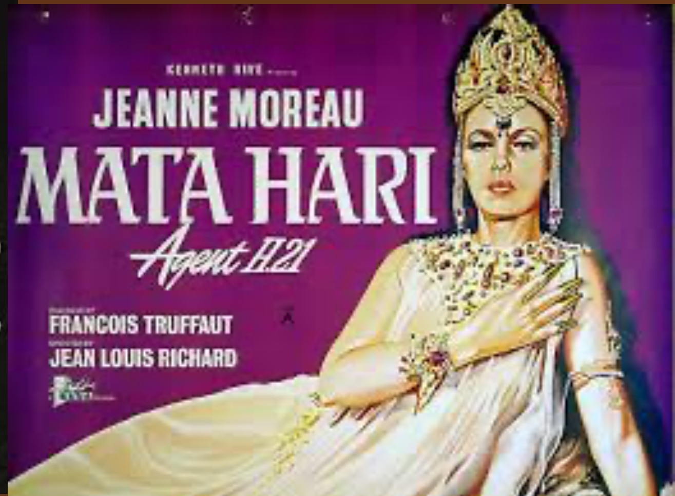
Greta Garbo (1931); Jeanne Moreau (1964)