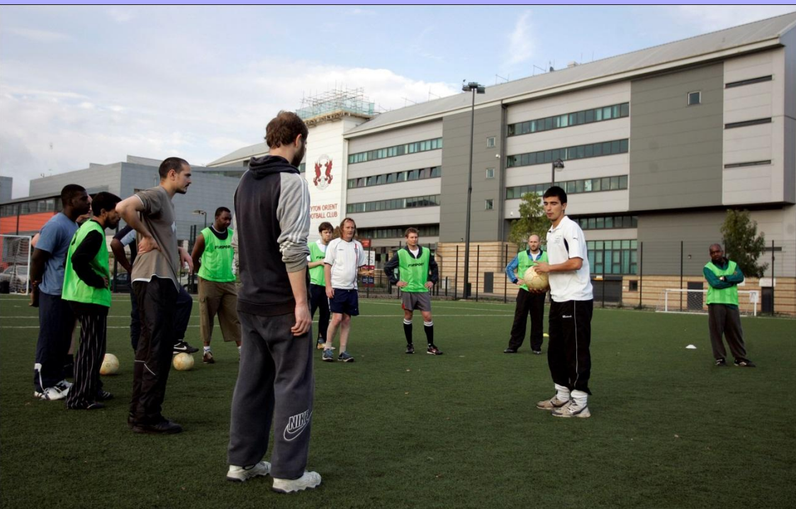
“Coping Through Football” project

City Bridge Trust partnership project “Fear and Fashion” invested £1 million to tackle knife crime in London