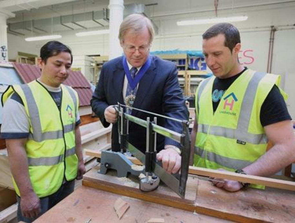
Lakehouse Building Lives Academy, Dragon Award Winner 2011