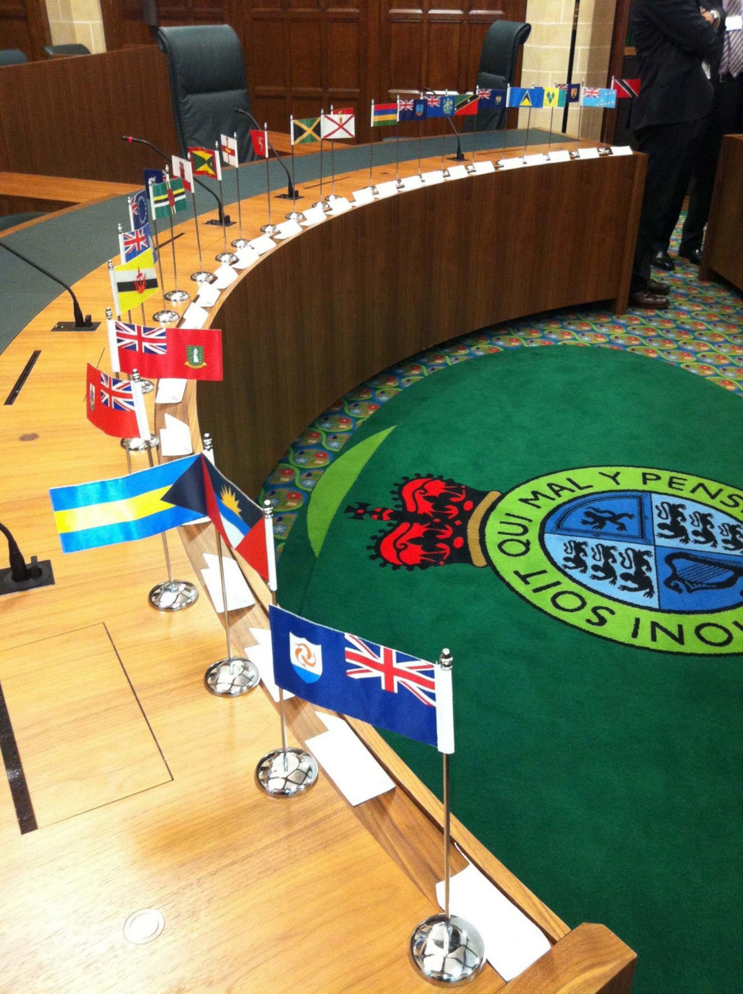
The Judicial Committee of the Privy Council