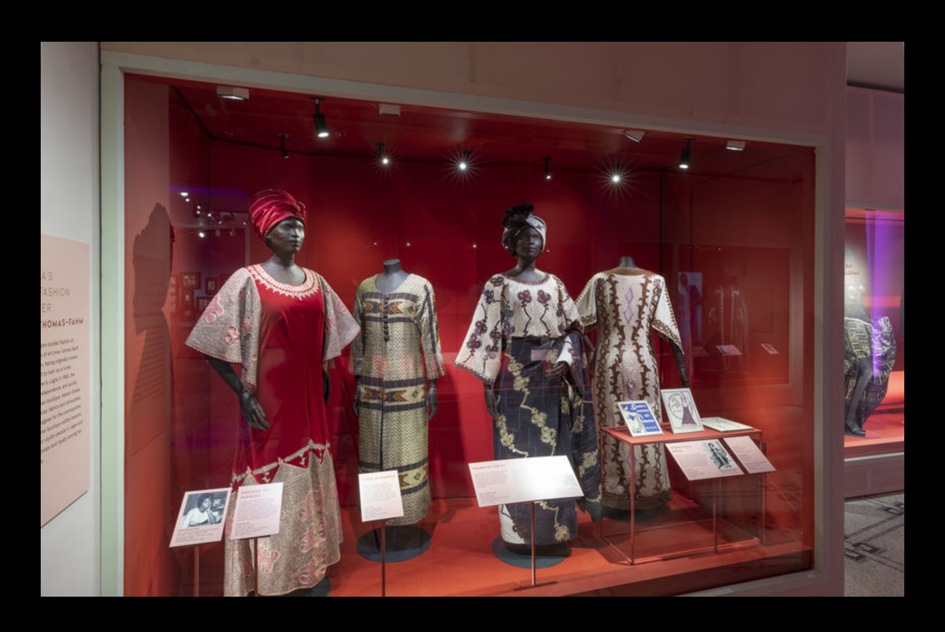
Africa Fashion, V&A, July 2022-April 2023, installation shot