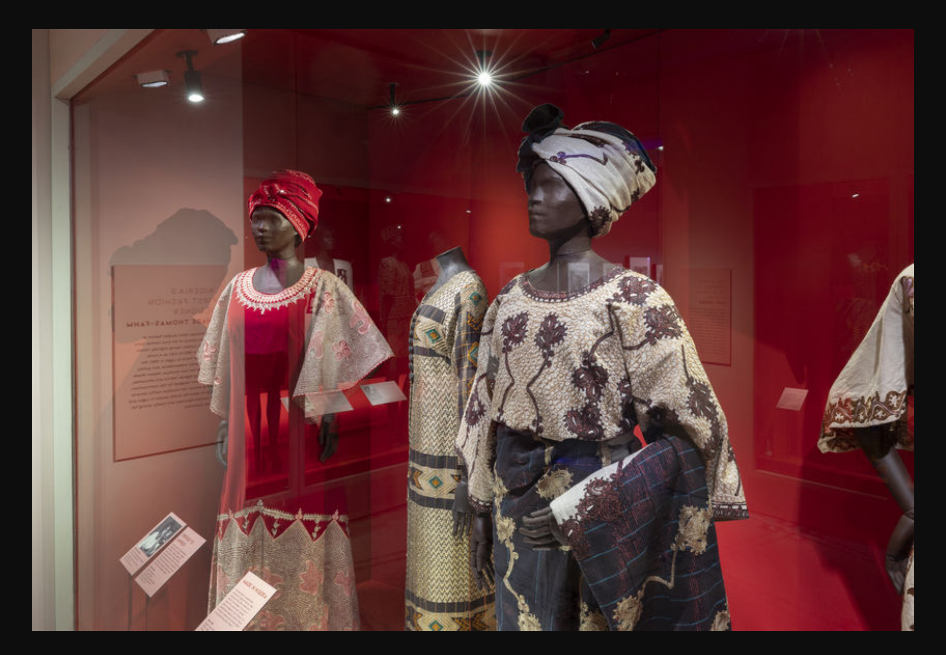
Shade Thomas Fahm Africa Fashion, V&A, July 2022-April 2023, installation shot