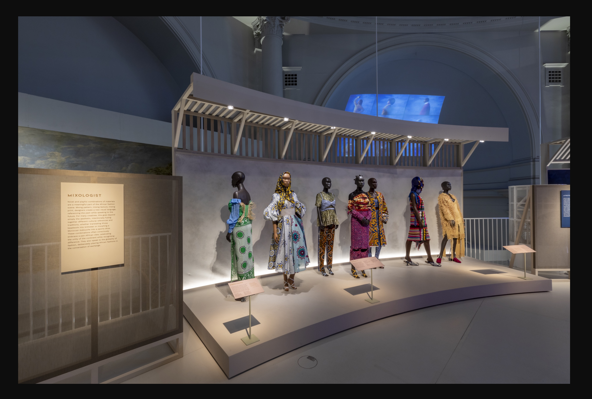
Africa Fashion, V&A, July 2022-April 2023, installation shot