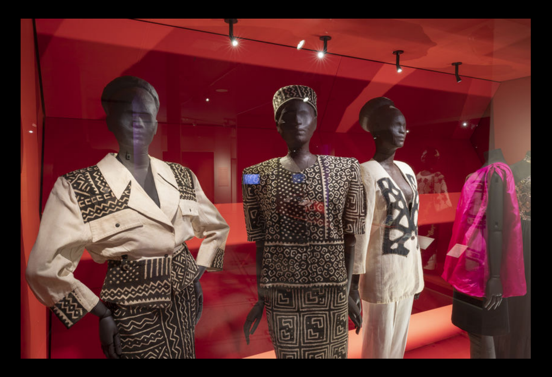
Africa Fashion, V&A, July 2022-April 2023, installation shot