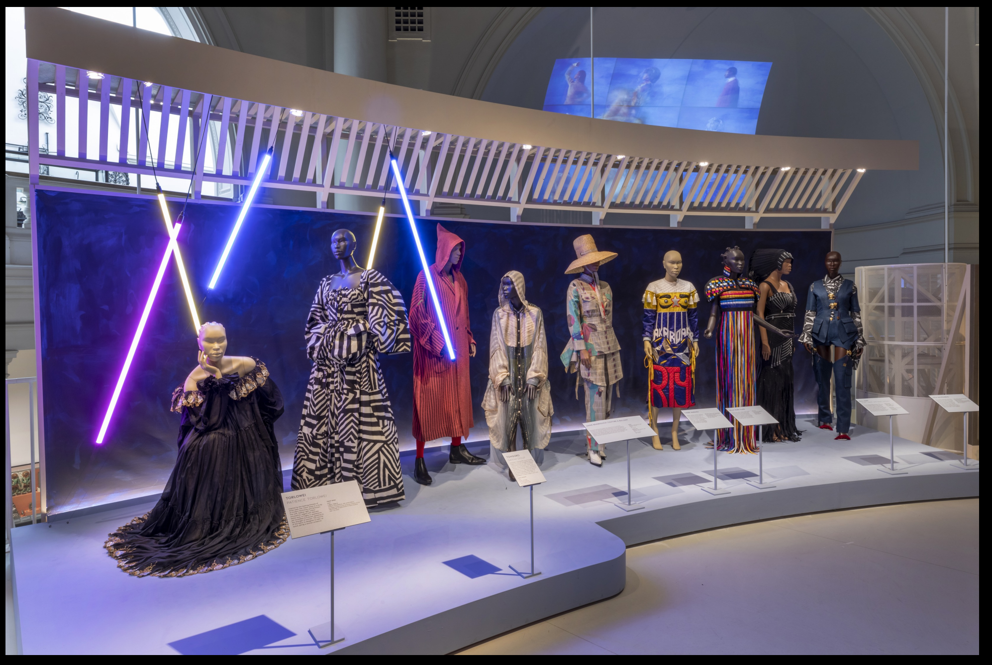
Africa Fashion, V&A, July 2022-April 2023, installation shot