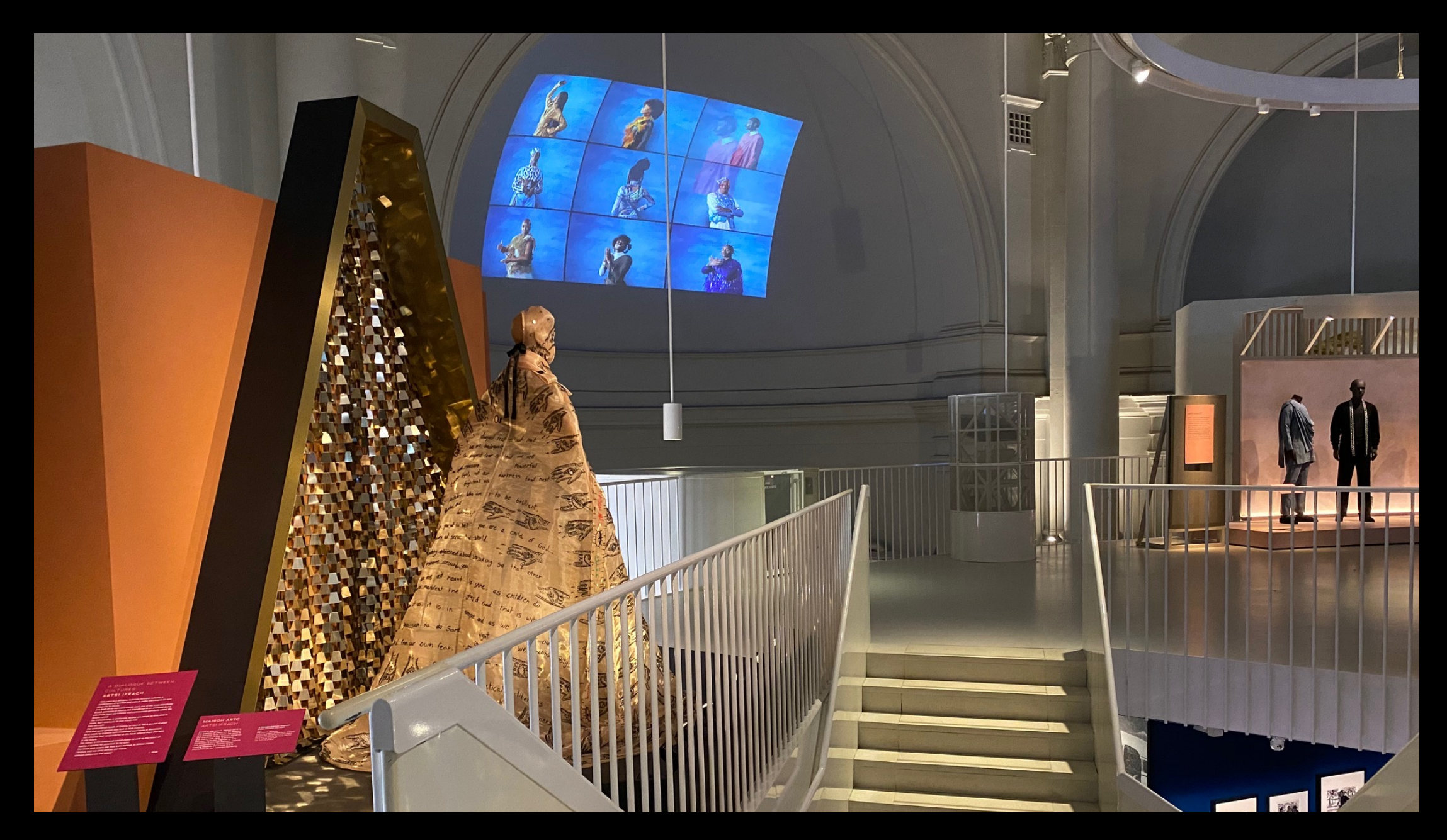
Africa Fashion, V&A, July 2022-April 2023, installation shot