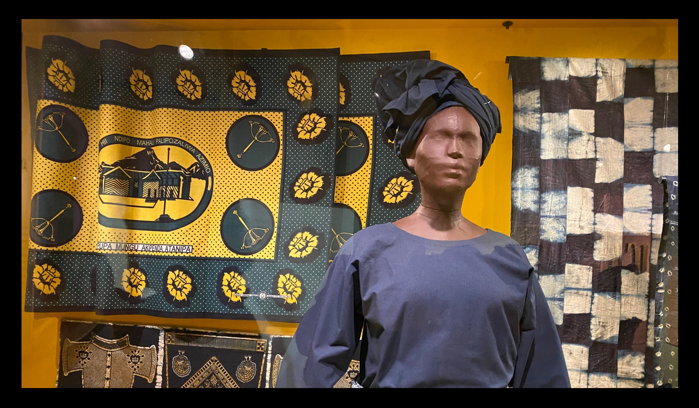
Africa Fashion, V&A, July 2022-April 2023, installation shot