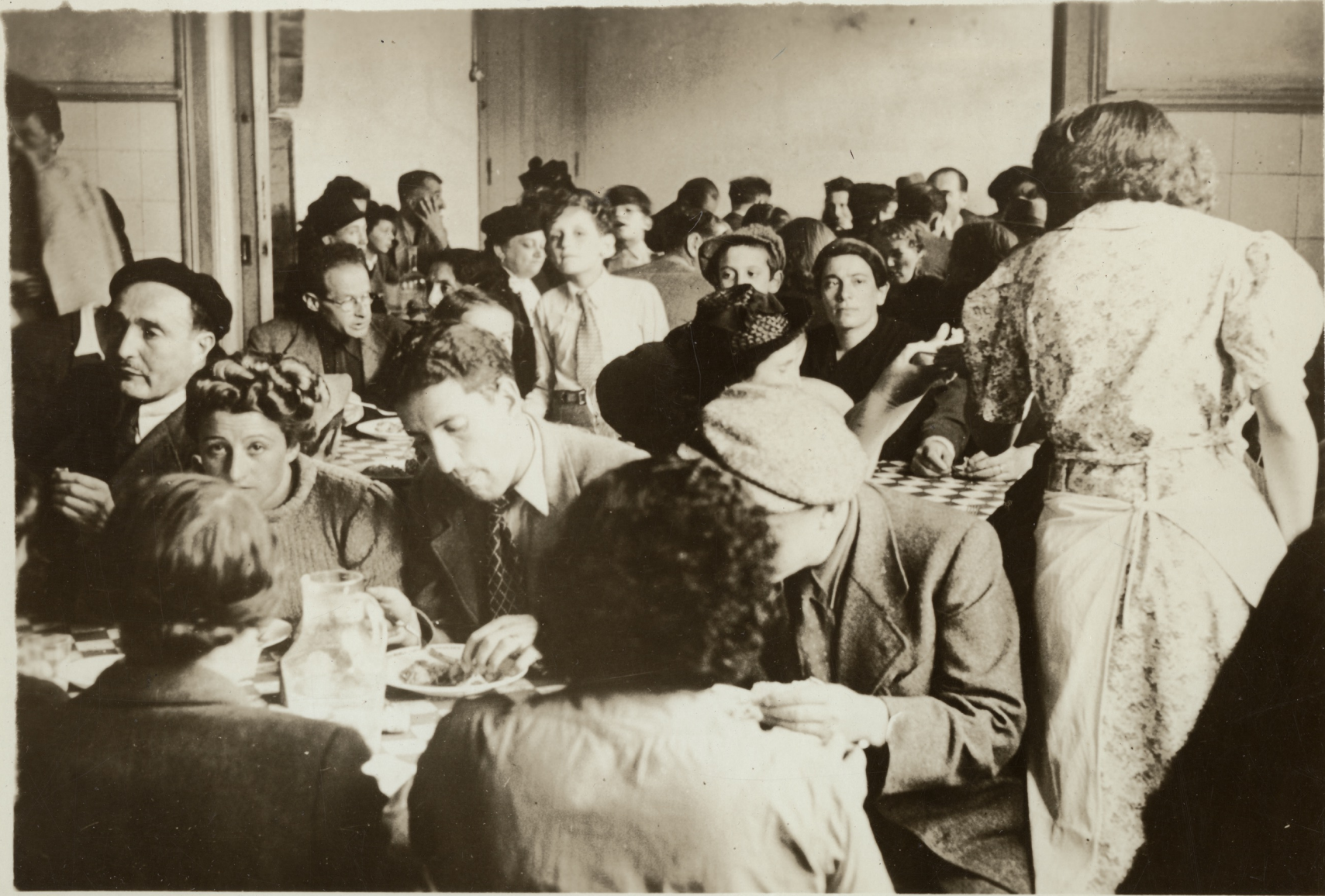
Soup Kitchen in Lisbon