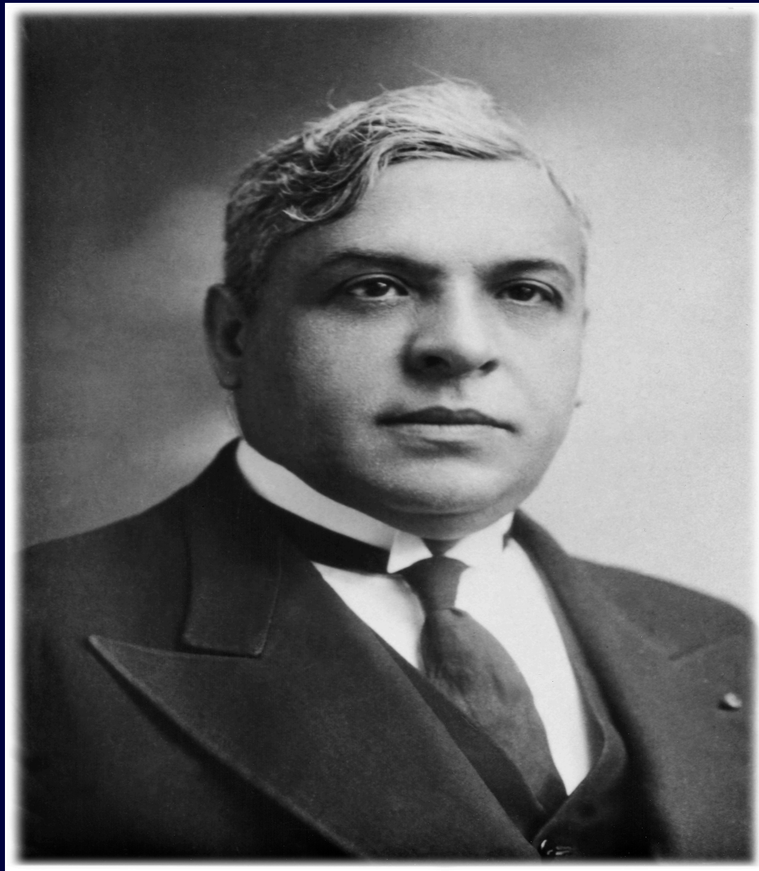
Aristides de Sousa Mendes, 1940