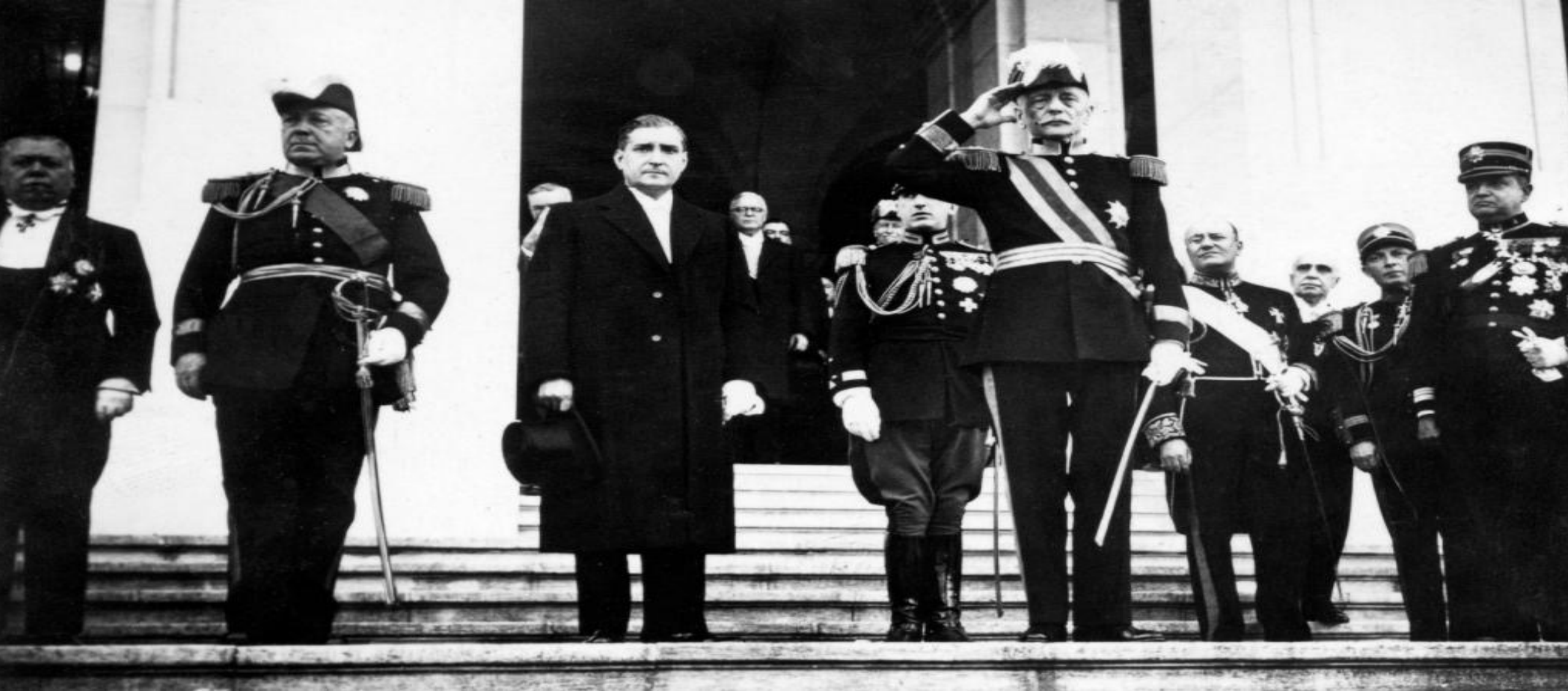
Prime Minister Antonio de Oliveira Salazar (in suit)