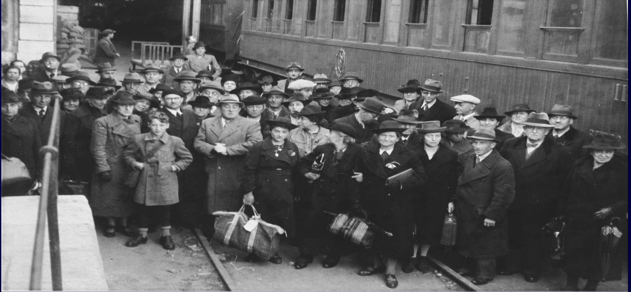
Newly arrived refugees at train station, Lisbon. September 1941.