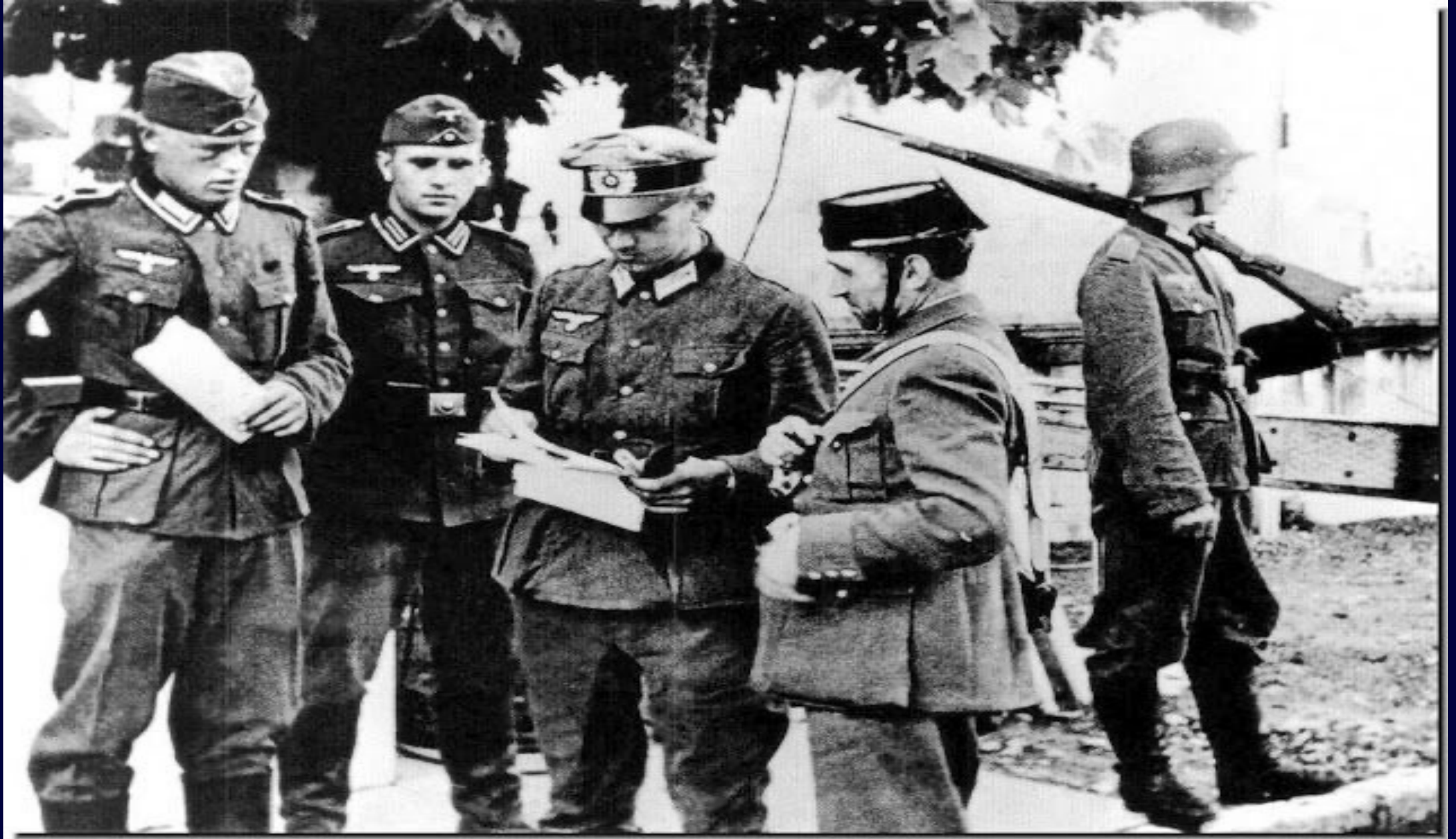
French-Spanish border. German officer with Spanish border guards.