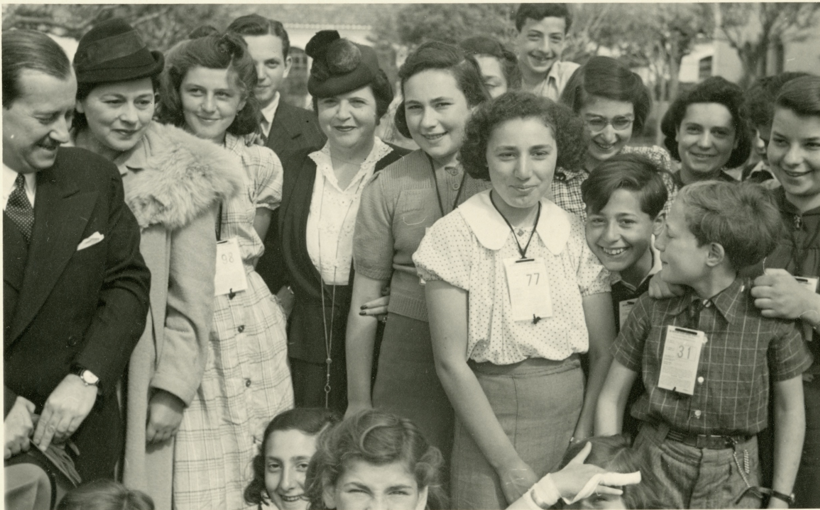
French refugee children.