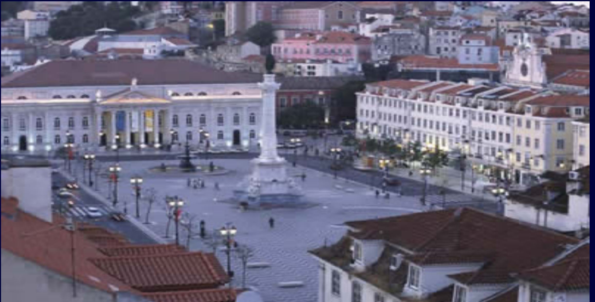
Rossio Square, Lisbon.